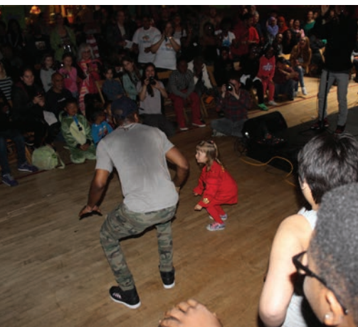
Celebrating May Day at Skateland.