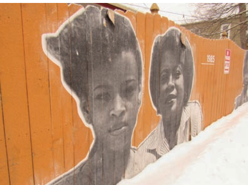
Community mural at 460 Massachusetts Ave.