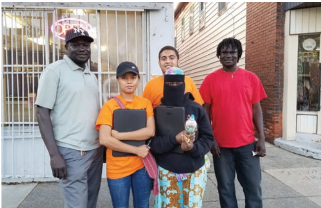
The PUSH Street Team meets with residents living on the West Side of Buffalo every day.

PUSH Buffalo was built on Community Organizing from the ground up. Over the years, the organizing work has grown more sophisticated as we follow through on the fights that the organization was built on. We believe that the quest for racial, economic, and environmental justice is an interconnected process and the most potent solutions are those that empower our members to address the systemic roots of our issues. The PUSH Organizing Team builds power through community building, community development, political education, and strategic campaigns.