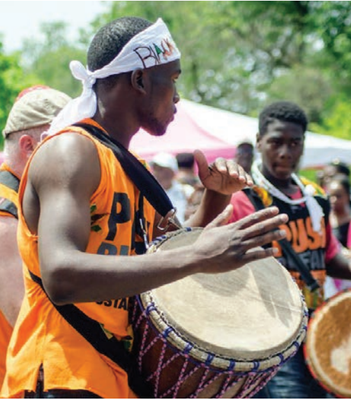
Drumming at the Juneteenth Festival.