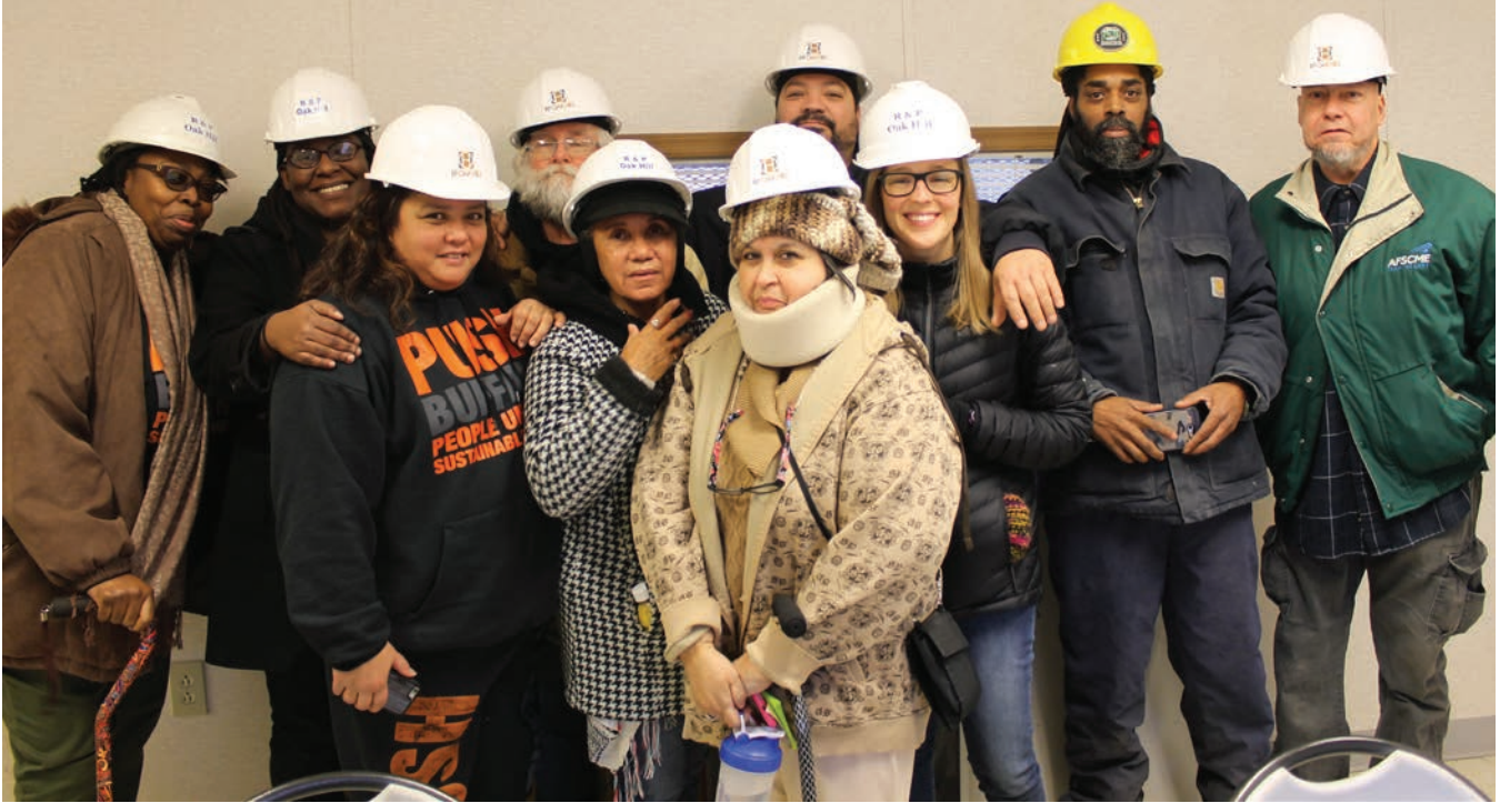
The PUSH Tour Committee gives tours of the Green Development Zone to local, regional, national, and international groups.