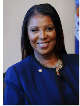
Letitia James Attorney General

The contract between a tenant and landlord, whether it is based on a written lease or a handshake, is one of the most common and important deals that are made across our state. It defines how renters will enjoy their homes, how owners will maintain their property, it can affect a neighborhood's stability.